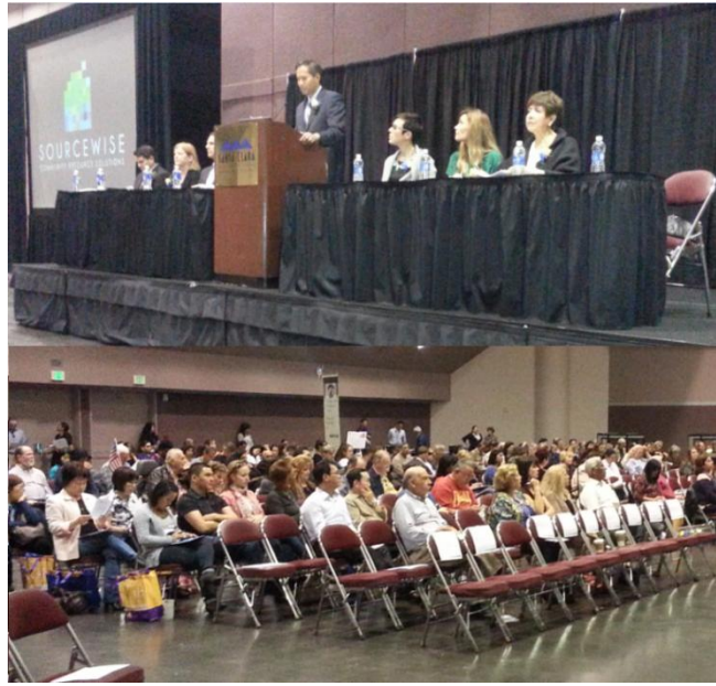
Beneficiaries, caregivers and other stakeholders in Santa Clara learn about the CCI

On April 16, over 400 Santa Clara seniors, people with disabilities, social workers, and caregivers attended the " Know Your Options " symposium hosted by Sourcewise (previously the Council on Aging Silicon Valley), and interpreters converted the information into Mandarin, Vietnamese, Russian, and Spanish. Presenters gave an overview and update about the CCI in Santa Clara, and representatives of Anthem CareMore, Santa Clara Family Health Plan, and On Lok described the services their respective programs will provide. Afterwards, participants asked questions about the provider networks during a Q&A session or asked questions one-on-one at the plan's booths.