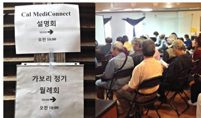
Beneficiaries learn about the CCI at the Korean Resource Center last Friday

On April 27, Keiro Senior Healthcare sponsored the Genki Conference and Resource Fair: Caregiver's Edition , presented in conjunction with the Westside Conference Organizing Committee, which includes Japanese Institute of Sawtelle, Venice Hongwanji Buddhist Temple, Venice Japanese Community Center, Venice Pioneer Project, Venice Santa Monica Free Methodist Church, Westlight Community