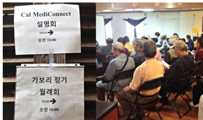
Beneficiaries learn about the CCI at the Korean Resource Center last Friday

On April 27, Keiro Senior Healthcare sponsored the Genki Conference and Resource Fair: Caregiver's Edition , presented in conjunction with the Westside Conference Organizing Committee, which includes Japanese Institute of Sawtelle, Venice Hongwanji Buddhist Temple, Venice Japanese Community Center, Venice Pioneer Project, Venice Santa Monica Free Methodist Church, Westlight Community