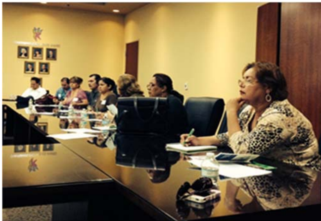
UDW members learn about the CCI

On April 28, 29, and 30, UDW, the Homecare Providers Union , participated in several presentations about the CCI. UDW is a nonprofit union that supports care providers so they can offer better care to IHSS recipients - many of whom are family, friends and community members. UDW also advocates for IHSS recipients' rights and correct assessments.