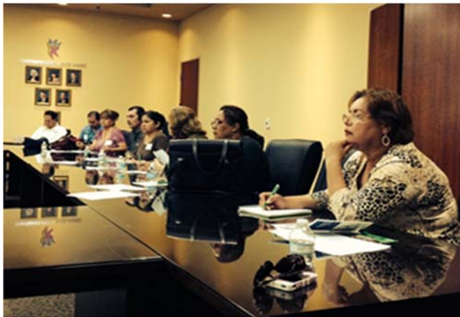
UDW members learn about the CCI

On April 28, 29, and 30, UDW, the Homecare Providers Union , participated in several presentations about the CCI. UDW is a nonprofit union that supports care providers so they can offer better care to IHSS recipients - many of whom are family, friends and community members. UDW also advocates for IHSS recipients' rights and correct assessments.