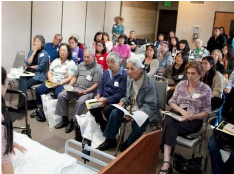
Participants learn about moving safely at the Genki Conference