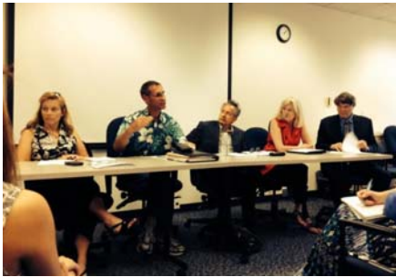
Speakers at last Friday's meeting with health plans about Cal MediConnect

UDW es una unión de trabajadores de cuidado en casa, por los trabajadores de atención domiciliaria. Cuidan de sus seres queridos y sus familias, o cuidan a miembros de la comunidad que necesitan su ayuda. En colaboración con la UDW una presentación en Español fue proporcionada para los trabajadores de IHSS. Las personas aprendieron sobre el proceso de inscripción en Cal MediConnect, los avisos, y los recursos disponibles si tienen preguntas en el futuro sobre el programa de Atención Médica Coordinada (CCI). Algunos ya habían recibido avisos, y otros tienen familiares que recibirán avisos. También se les informó que pueden llamar a HCO para recibir los avisos en otros lenguajes, en este caso en Español.