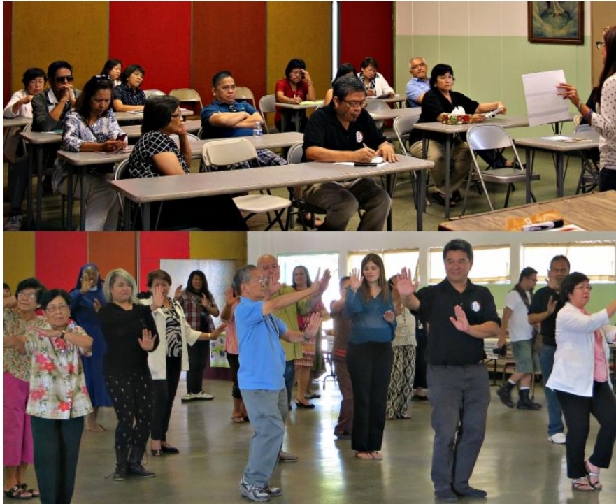
9/27 - Our Lady of Lourdes church in Montclair held a Health & Wellness Fair sponsored by two San Bernardino Archdiocese groups - Filipino Ministry and The Asian Pacific Ministry group . During the fair, 19 attendees took part in a one-hour presentation about new health care options under the CCI, including seniors, senior center coordinators, doctors, medical association members, and family caregivers. Afterward, there was also a CCI information booth available during the health fair, and Spanish interpreters were on site to answer questions. The event was attended by 55 people whom also participated in blood pressure screenings, Tai Chi and Zumba exercises, and a free acupuncture session.