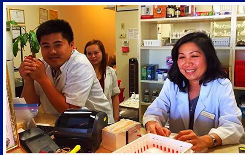
Staff at California Pharmacy

12/10 and 12/30 - Pharmacists and staff of California Pharmacy and May Pharmacy learned about OneCare Connect and the implementation of the CCI in Orange County.