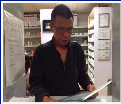
Pharmacist at May Pharmacy

The presentations centered on continuity of care for pharmacies and the value of coordinated care for both beneficiaries and providers. Each pharmacy received informational resources to support their staff and the beneficiaries they work with.