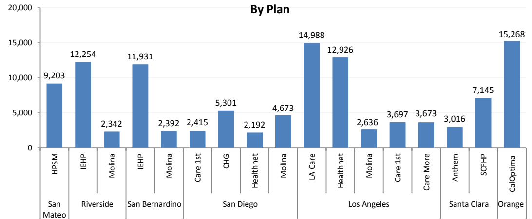
HCO Call Center Stats July 2017