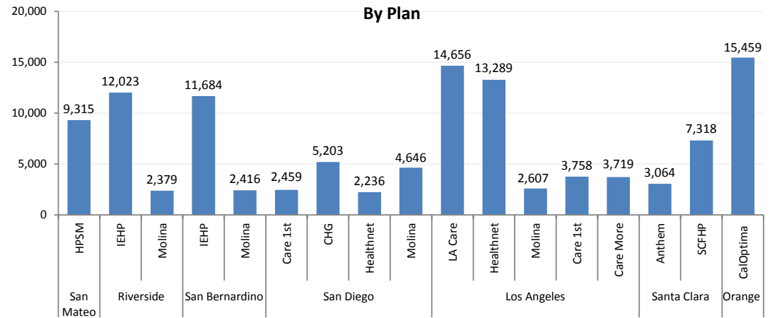
HCO Call Center Stats May 2017